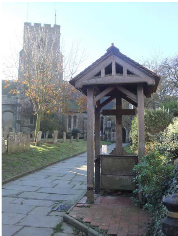
The Churchyard War Shrine , 2014